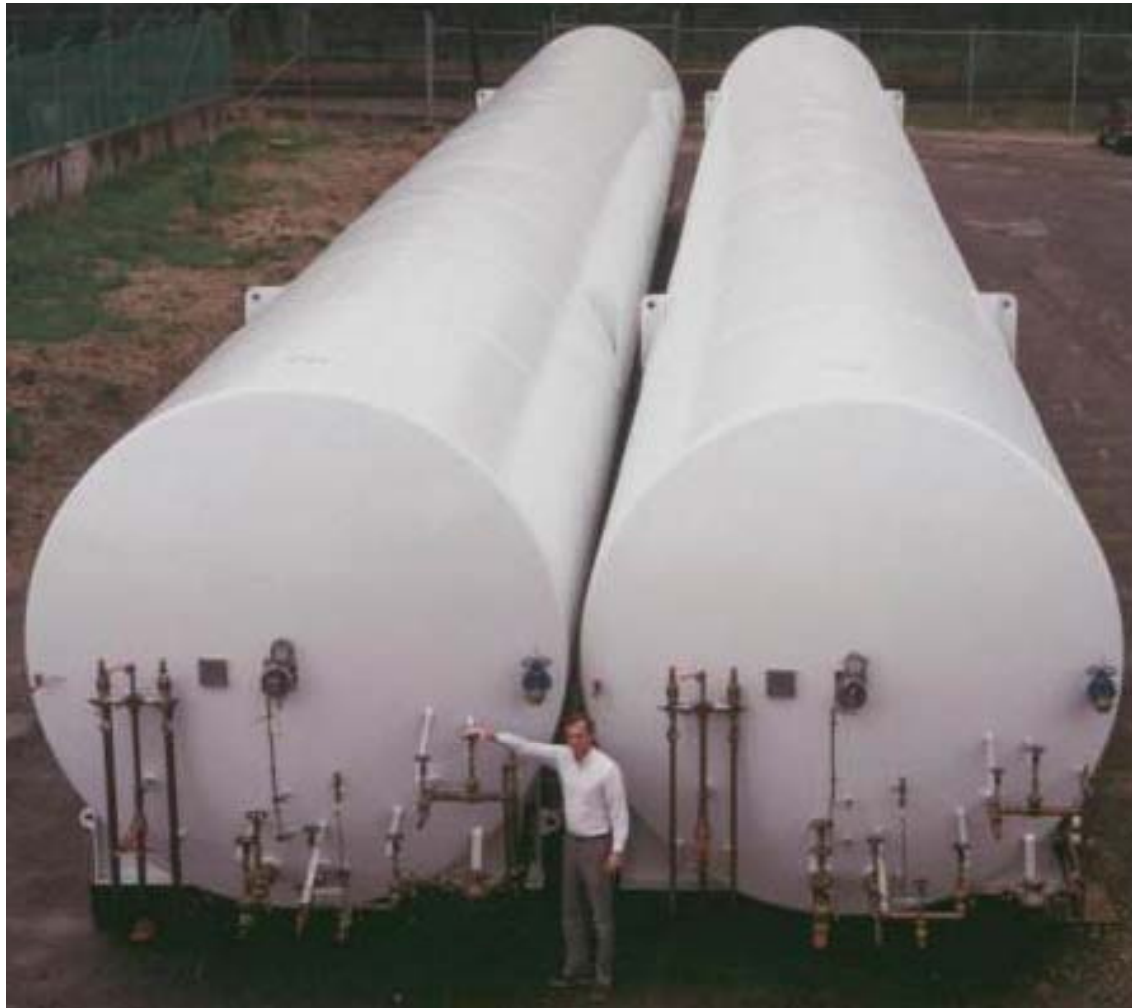
LNG Storage Tanks