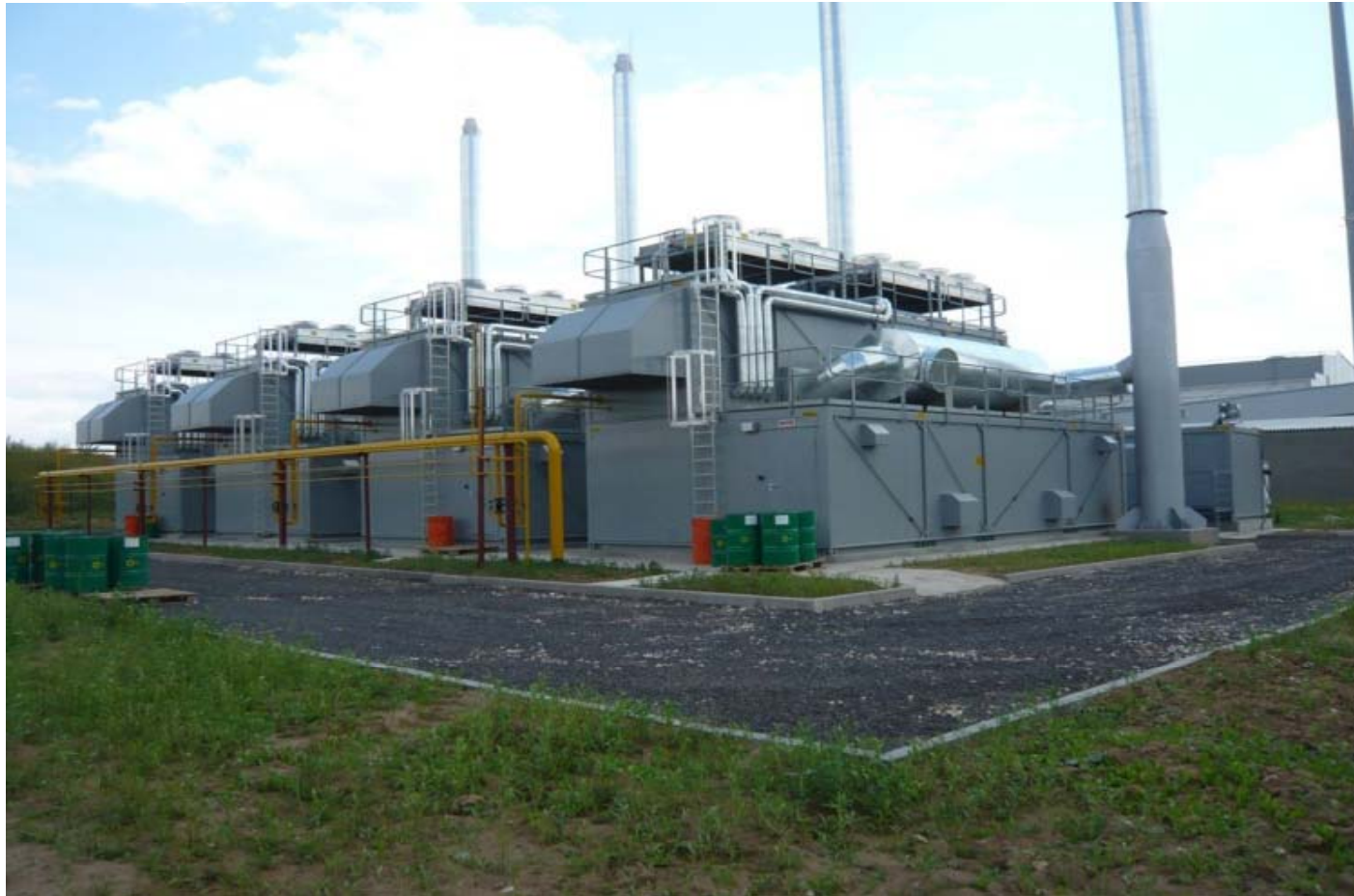
Natural Gas Fueled Power Plant