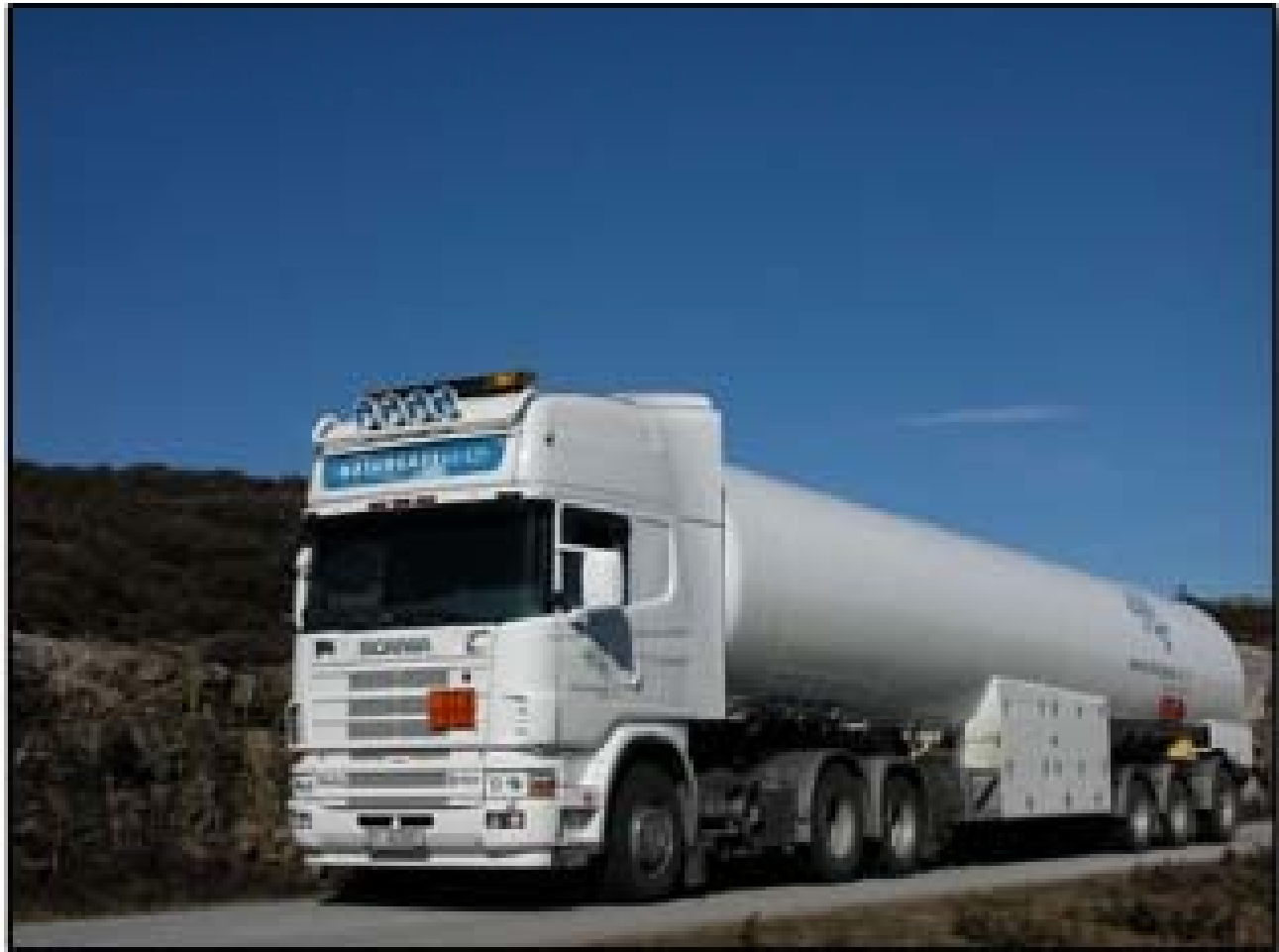
LNG Tank Truck