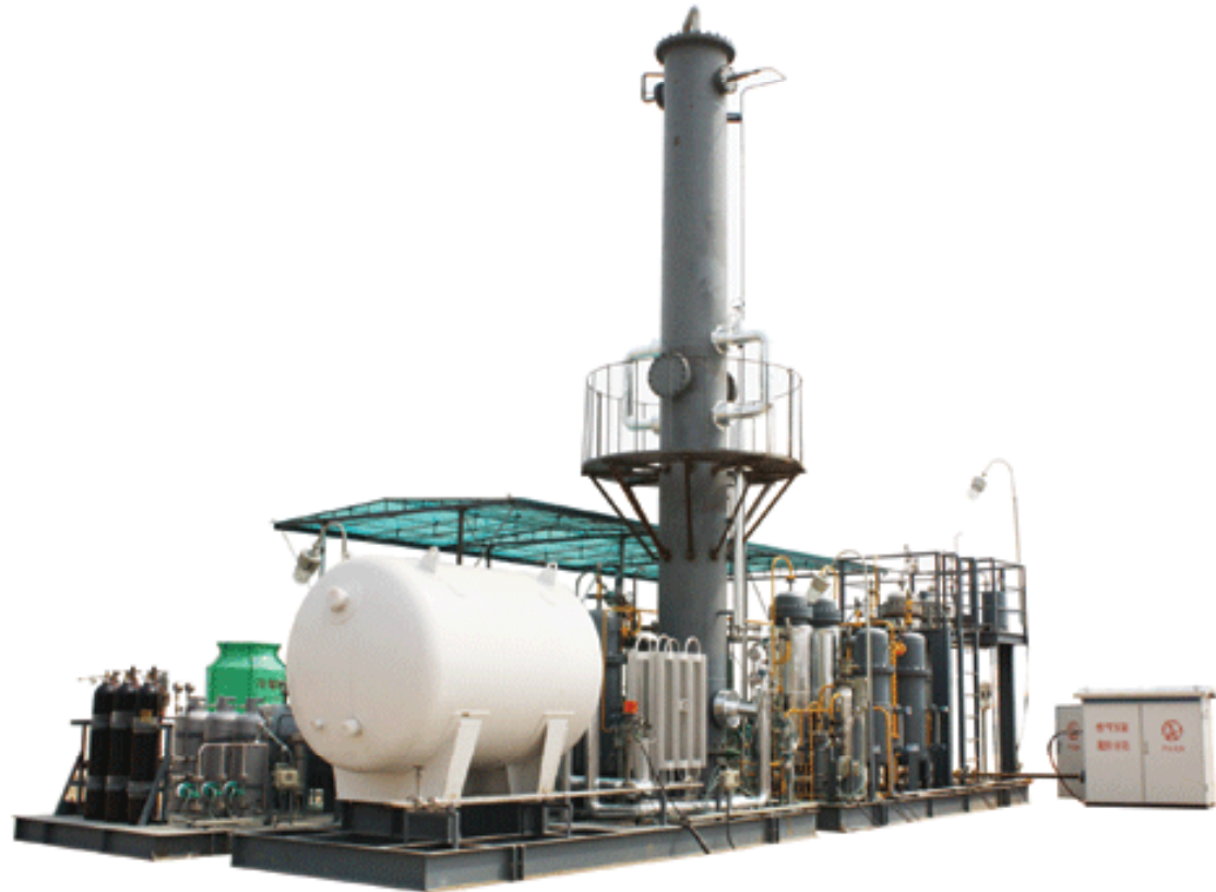
Small Skid Mounted Liquefaction Plant